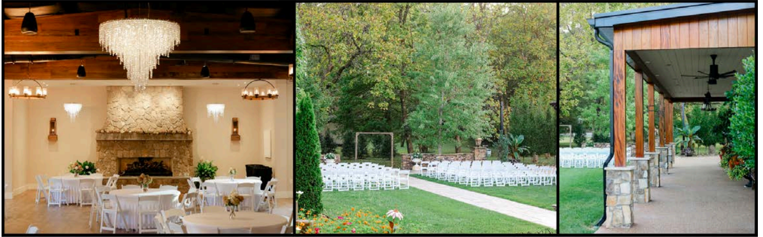
The Calico | The Calico Lawn

Discover the epitome of elegance and grandeur at The Calico , our largest event venue nestled toward the back of the breathtaking expanse of Creekside Gardens. Designed with formal events in mind, this space is bathed in natural light and adorned with modern dressings. Including a spacious and immaculately groomed lawn for additional space - this magnificent venue offers a seamless fusion of beauty and sophistication sure to exceed your (and your guests) expectations.